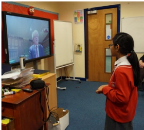
Ask the speaker